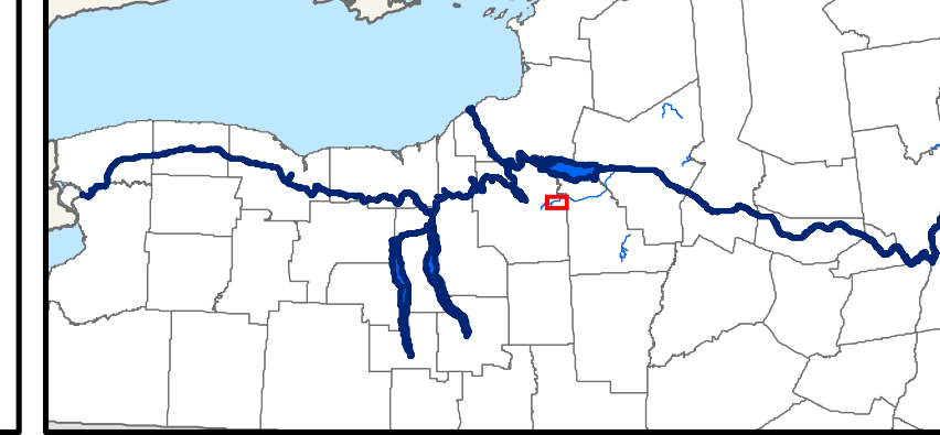
Figure 62D: Parklands and Historic Sites Town of Manlius and Village Fayetteville